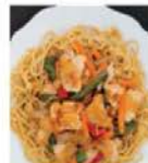
450 Chicken Lo Mein Skillet Meal