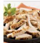
496 Fire Grilled Chicken Breast Strips