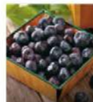
804 Whole Blueberries "All Natural"