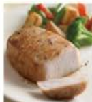
393 Boneless Pork Loin Chops