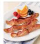
811 Fully Cooked Bacon Slices