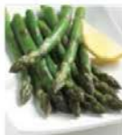
781 Asparagus Spears