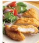
404 Oven Baked Chicken Breast