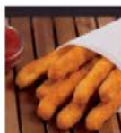
518 Chicken Fries