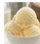
204 Vanilla Ice Cream