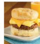
898 Sausage, Egg & Cheese Breakfast Sandwich