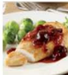
502 Unbreaded Chicken Breast

Call 1-855-870-7208 and provide Campaign ID: 28051 and Team Member ID, if applicable.