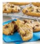
644 Chocolate Chip Frozen Cookie Dough