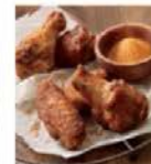
414 Oven Roasted Chicken Wings with BBQ Dry Rub Seasoning