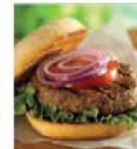
458 Black Angus Burgers