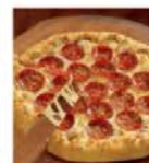
603 Pizzeria Pepperoni Pizza