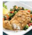
503 Ancient Grain Encrusted Cod